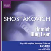
SIGCD052 Hamlet & King Lear Dmitri Shostakovich City of Birmingham Symphony Orchestra / Mark Elder